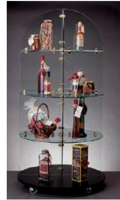
30" Revolving Pedestal 30" Round frameless revolving glass display with black base