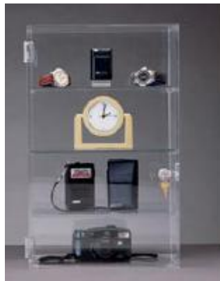
Counter Top Acrylic Showcases with Lock 4 Shelf 10"w x 15"h x 5"d