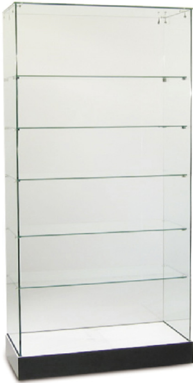
High Upright Full Vision Showcase

FULL VISION SHOWCASES Give your décor a touch of elegance and class while providing the ideal setting for displaying your product.