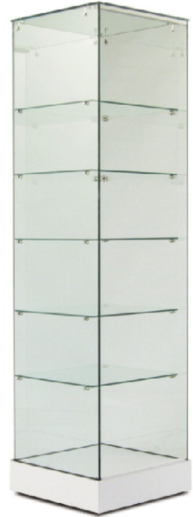
Tower Full Vision Showcase

These showcases are sold by special order only. A deposit may be required at time of ordering. There are many options and other models available. Please call for details.