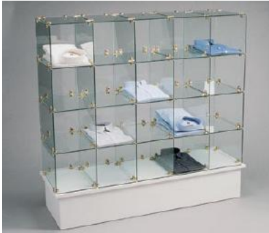
Glass Cube Unit

All glass cube units shipped unassembled by common carrier or truck, whichever is most economical. We can price out any size glass cube unit, for details please call us.