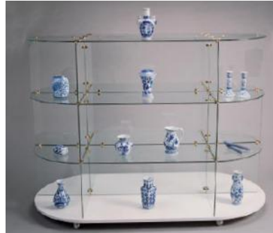
54" Oval Gondola Display 54"Lx 30"W Oval glass gondola display with black base.