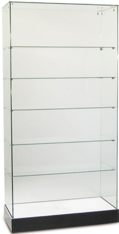
High Upright Full Vision Showcase