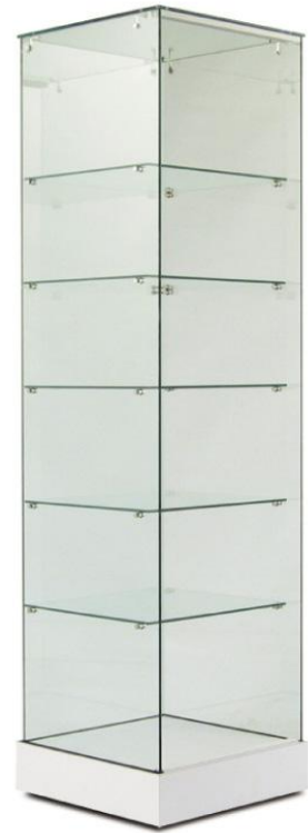
Tower Full Vision Showcase

These showcases are sold by special order only. A deposit may be required at time of ordering. There are many options and other models available. Please call for details.